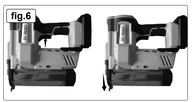
Squeeze the trigger, keep squeezing and don't release.

Push the single/contact firing switch to the right side, see fig.2, it is on Contact Firing mode. Contact Firing is good for quick and convenient firing.