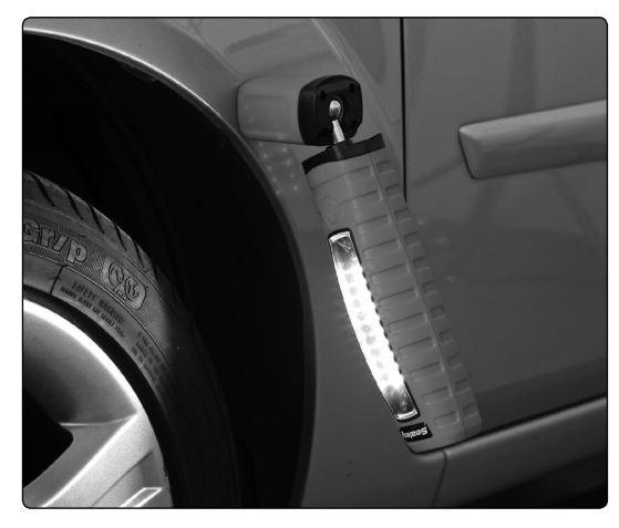
360° Swivel and tilt function. Base magnet