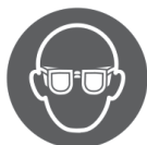
Wear eye protection