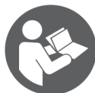
Refer to instructions

IMPORTANT: PLEASE READ THESE INSTRUCTIONS CAREFULLY. NOTE THE SAFE OPERATIONAL REQUIREMENTS, WARNINGS & CAUTIONS. USE THE PRODUCT CORRECTLY AND WITH CARE FOR THE PURPOSE FOR WHICH IT IS INTENDED. FAILURE TO DO SO MAY CAUSE DAMAGE AND/OR PERSONAL INJURY AND WILL INVALIDATE THE WARRANTY. KEEP THESE INSTRUCTIONS SAFE FOR FUTURE USE.