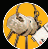
Chubb style, serial numbered keys

Note: weights and dimensions are approximate. External dimensions include handles.