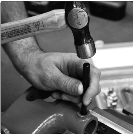
4.5 Remove the tag from the insert using the breaking pin tool.