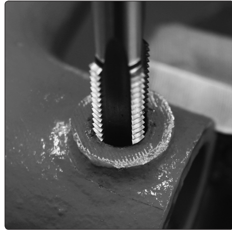
4.2 Tap drilled hole using screw tap provided.