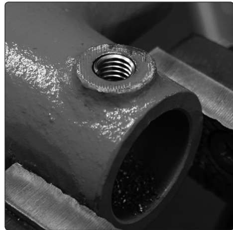
4.6 Thread is repaired and ready to use.

NOTE: It is our policy to continually improve products and as such we reserve the right to alter data, specifications and component parts without prior notice.