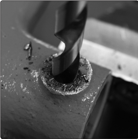
4.1 Drill out the damaged thread using the correctly sized twist drill bit provided.