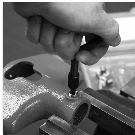
4.4 Screw insert into threaded hole.