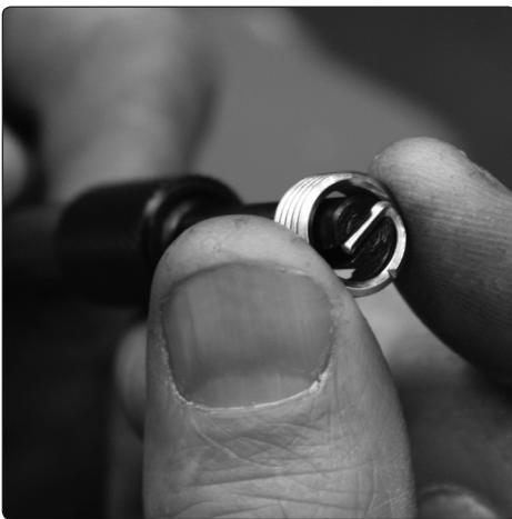
4.3 Load thread insert into installation tool.